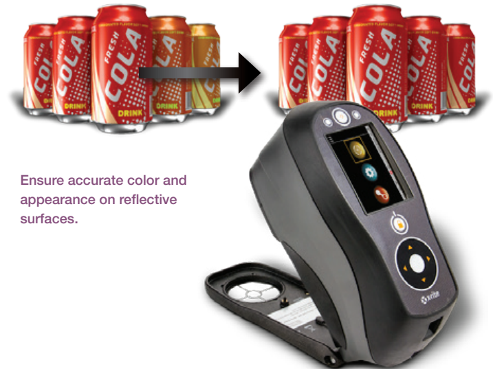
Ensure accurate color and appearance on reflective surfaces.